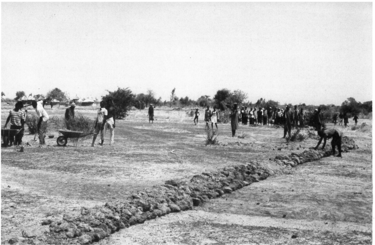
Fig. 3. Stone line construction by Mossi farmers in Bam, Burkina Faso.

agroforestry in dryland Africa (Critchley et al. , 1994; Harrison, 1987). Farmers are suffering poor crop yields and pasture quality, but have proved particularly keen to embrace new ideas and methods to conserve soil and water. Some of these ideas have come from European volunteers and farmers experimenting together, and are transforming the landscape around hundreds of villages. Contour stone lines built by farmers and consisting of lines of stones and rocks placed across the land contour, are cheap and popular erosion control methods and are much publicised by development projects (Fig. 3). These are built to slow the erosive overland flow from summer rains and to encourage the deposition of sediment and nutrients up-slope, thus benefiting crops and trees.